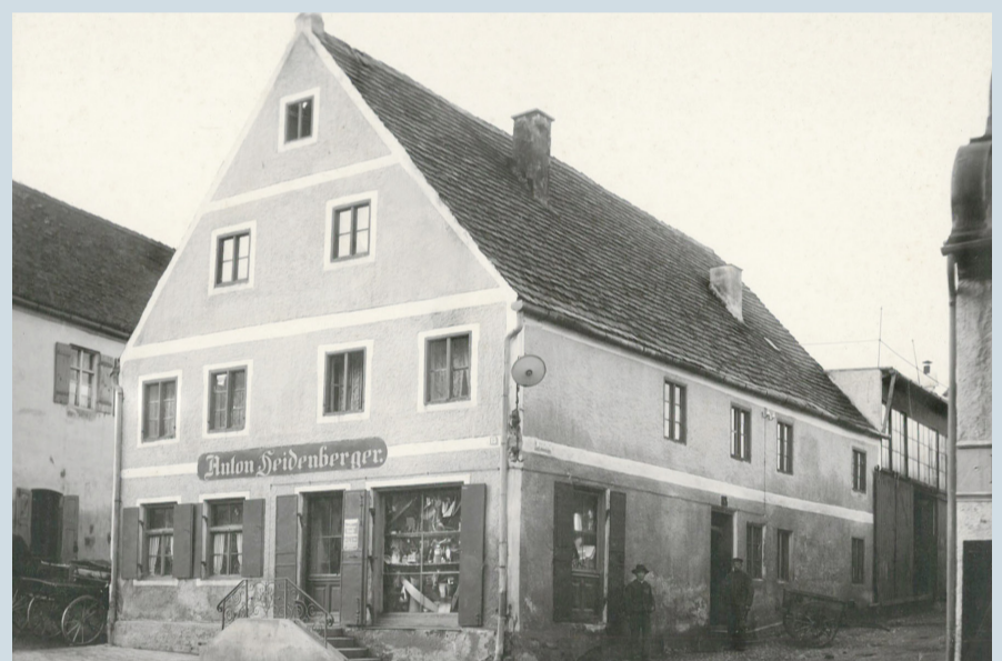
The old “Heidenberger’s House”, 1908