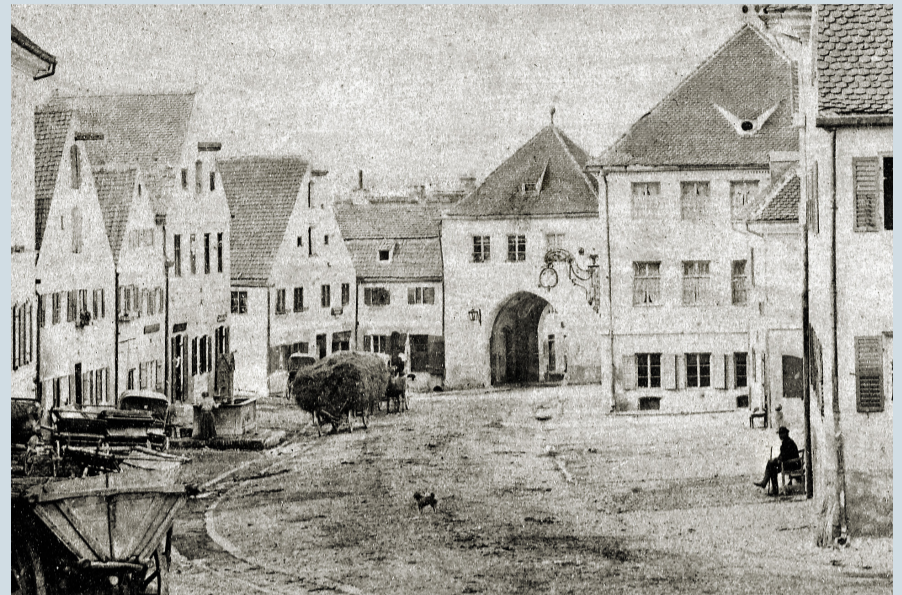
The “Gate Baker’s House” (3rd left) near the “Augsburg Gate”, before 1892

Following the requirements of the times, the locksmith’s shop was converted into a garage in the early 1960s, where cars were repaired and new cars sold until the firm moved to the Dachau-Ost business park.